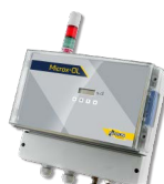
Microx-OL Online Oxygen Analyser