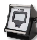
GazTrak Portable oxygen & moisture measurement