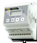
Microx Oxygen Analyser