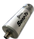
SENZTX Oxygen Transmitter