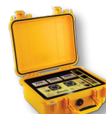
Yellow Box Portable O 2 Analyser